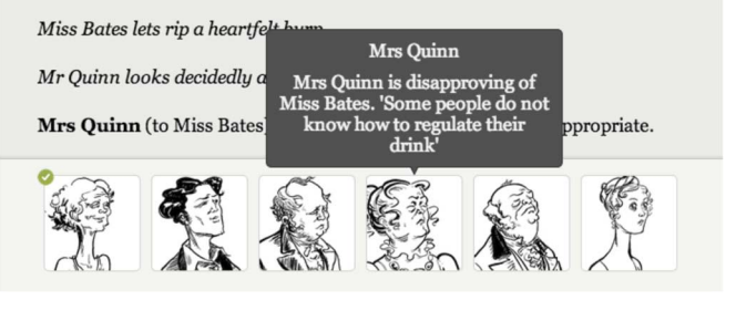
Fig. 2. Each character's emotional state is displayed along with explanatory text.

Lucy gives Miss Bates a small, reassuring smile.